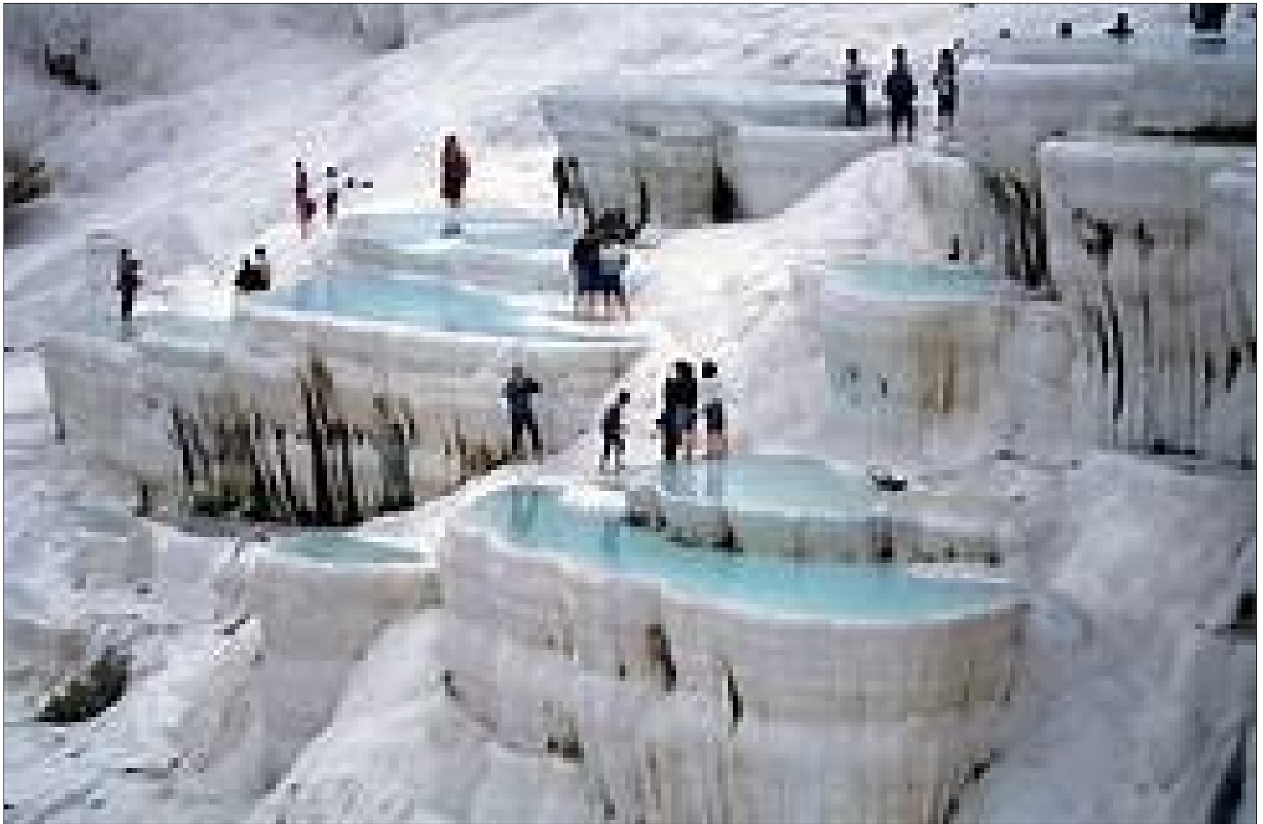
Pamukkale is Turkey's famous white "cotton castle" with natural mineral basins and bright blue pools.